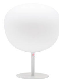
Table lamp with diffuser in satin-finish white blown glass. Supporting structure made of metal or polyester reinforced with glass fibre, painted white.